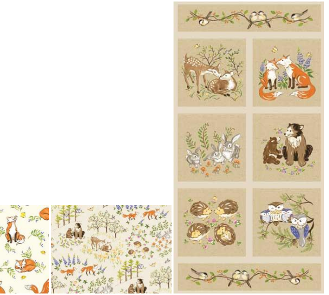
From Free Spirit: